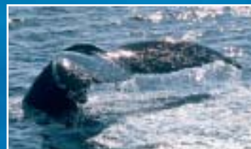
HW - Humpback whale