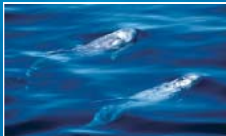
RD - Risso's Dolphin