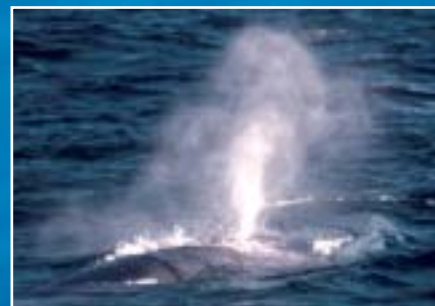
FW - Fin whale