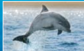
BND - Bottlenose Dolphin