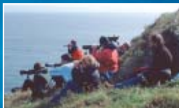
Whale watchers on Cape Clear Island, Co. Cork

According to Greek myth the shape of the most beautiful goddess of all, Aphrodite, was formed out of the swirling sea foam & spray & brought to land by dolphins on a giant scallop shell, brought up from the depths of the ocean on the back of a whale.