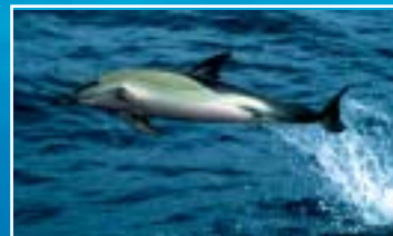
CD - Common Dolphin