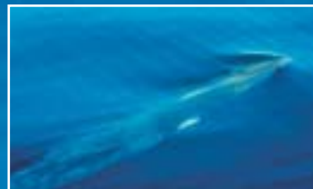
MW - Minke whale