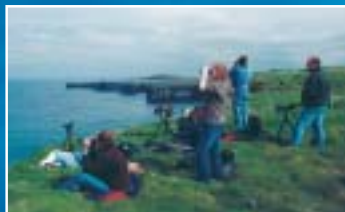
Whale watchers on Loop Head, Co. Clare