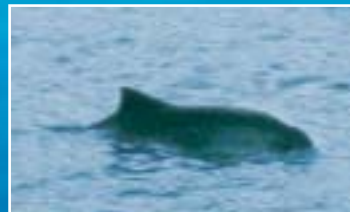
HP - Harbour porpoise