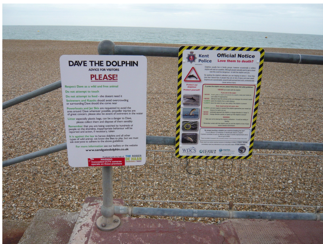
Fig. 1: Example poster displays erected along Dave's home range

giving specific information regarding Dave's whereabouts, something which local medics had sought to keep out of the media. Various events and meetings were arranged during this time such as the Chamber of Commerce Group and stalls at local festivals. Whether it was because of the website or the surge in visitors to the beach, there was also an increased media presence which again presented opposing views as to the management of the situation surrounding the dolphin. Despite efforts to engage the hosts of the website with scientific views of the situation, the difference of opinion continued throughout the summer of 2007.