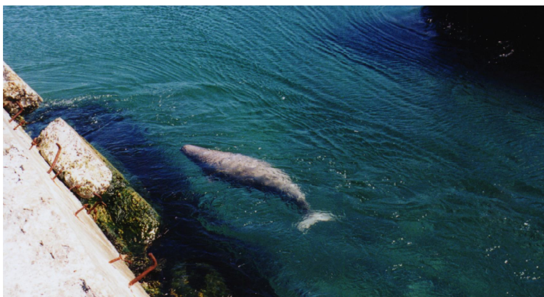
Fig. 2: Solitary juvenile beluga foraging around a harbour entrance in south-eastern Newfoundland.

Most animals appeared to remain in comparatively shallow, nearshore waters during their visit to Newfoundland. Residency patterns varied, with some animals remaining in an area for weeks or months, while others repeatedly moved along the coast. In 2003, a juvenile male narwhal was reported resident in a bay in south-eastern Newfoundland near a grounded iceberg, where it remained until the iceberg had mostly melted.