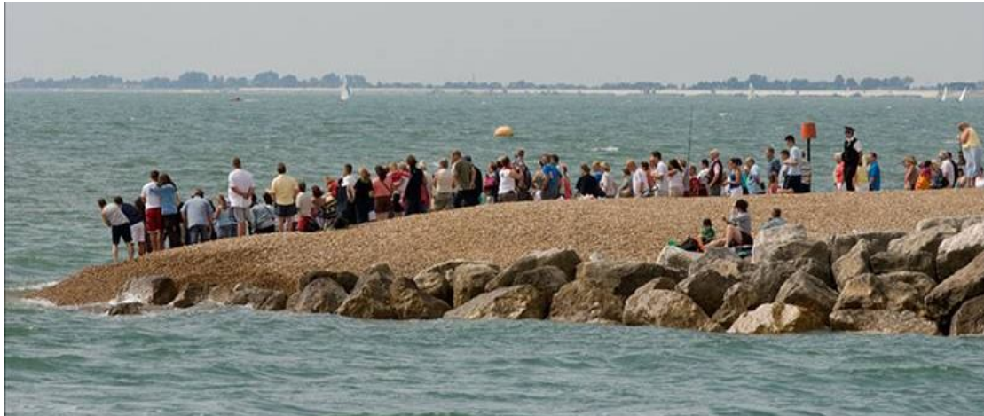
Fig. 2: August, national holiday weekend – people turn out to see Dave.

solitary, sociable dolphin. This meant that during August 2007, there was significant lack of any regulation or enforcement of the legislation as detailed in Figure 2.